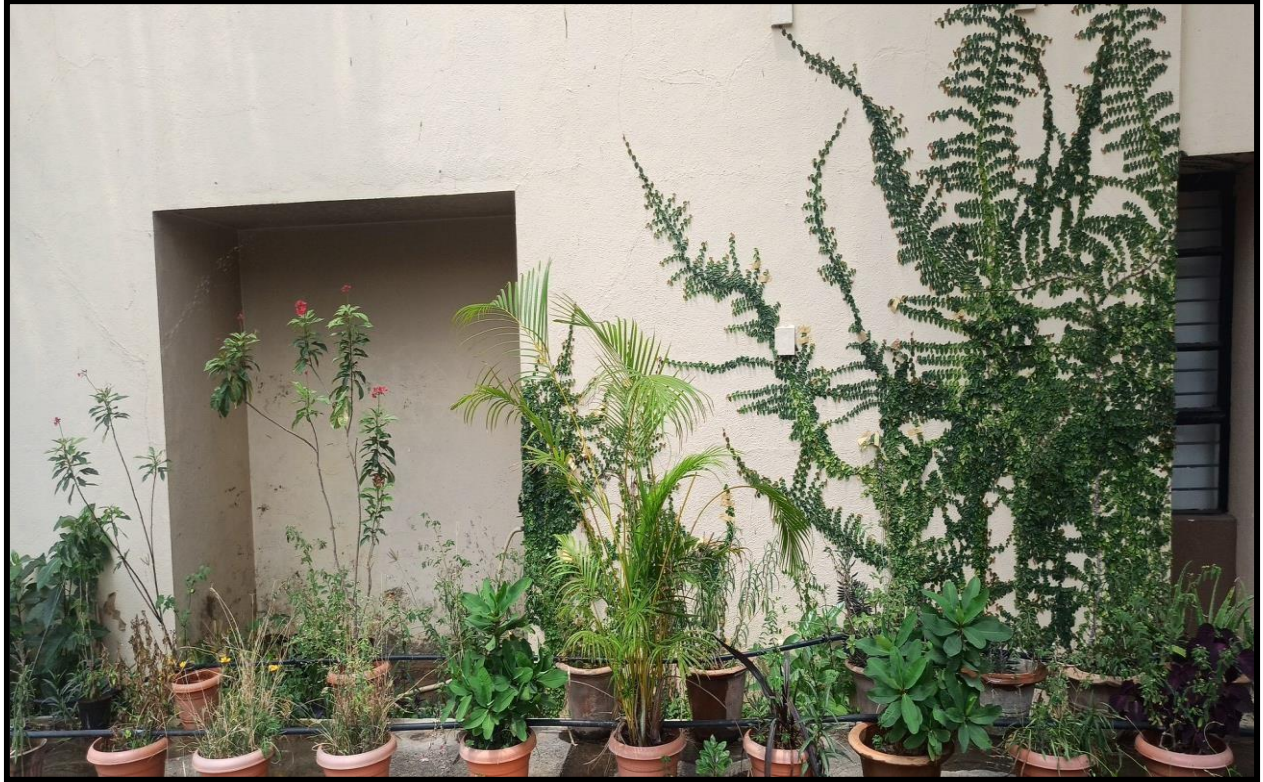
Botanical/ Medicinal Garden (Department of Botany)

NAAC Reaccredited (Third Cycle) B++ (CGPA 2.95)