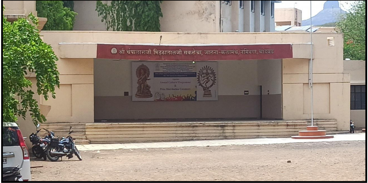
Stage for Cultural Program

NAAC Reaccredited (Third Cycle) B++ (CGPA 2.95)