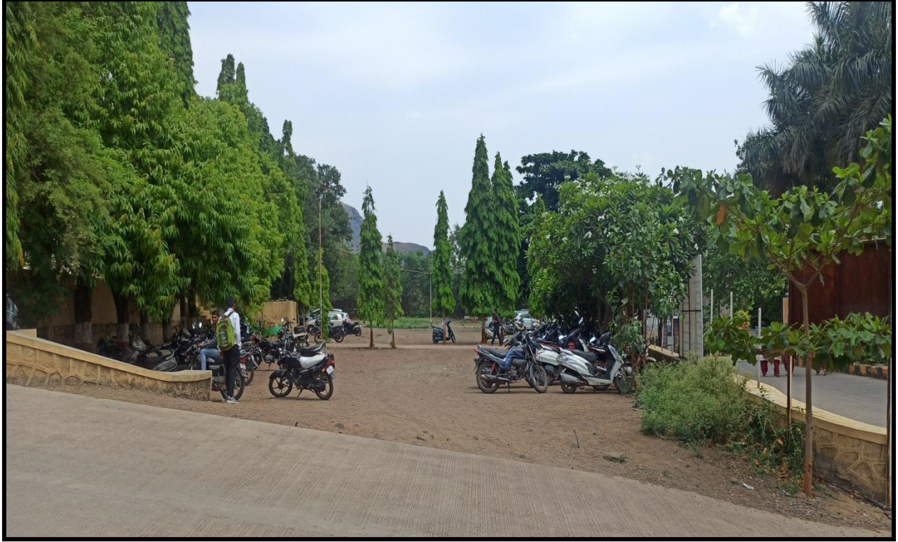
Parking (Two-Wheeler and Four-Wheeler)

NAAC Reaccredited (Third Cycle) B++ (CGPA 2.95)