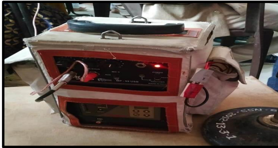
Amplifier with speaker (Battery backup & Charging)

NAAC Reaccredited (Third Cycle) B++ (CGPA 2.95)