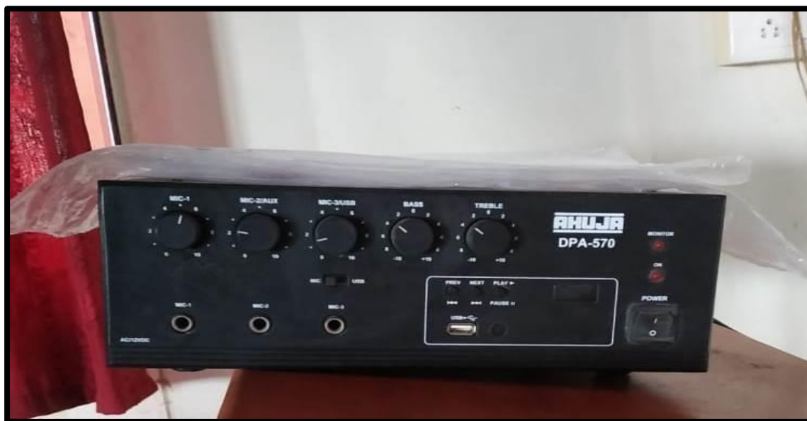
Amplifier, 50 Watts with Built-In Digital Player.

NAAC Reaccredited (Third Cycle) B++ (CGPA 2.95)