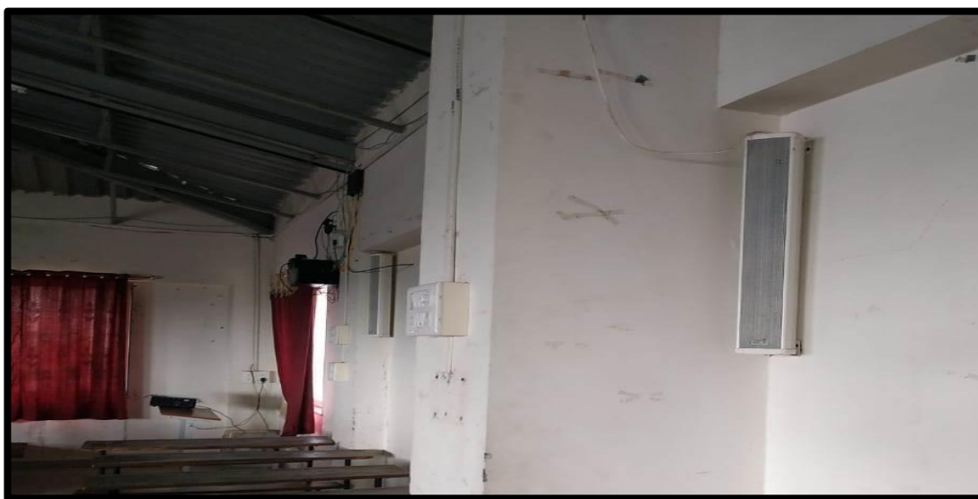
Pillar Speaker Unit