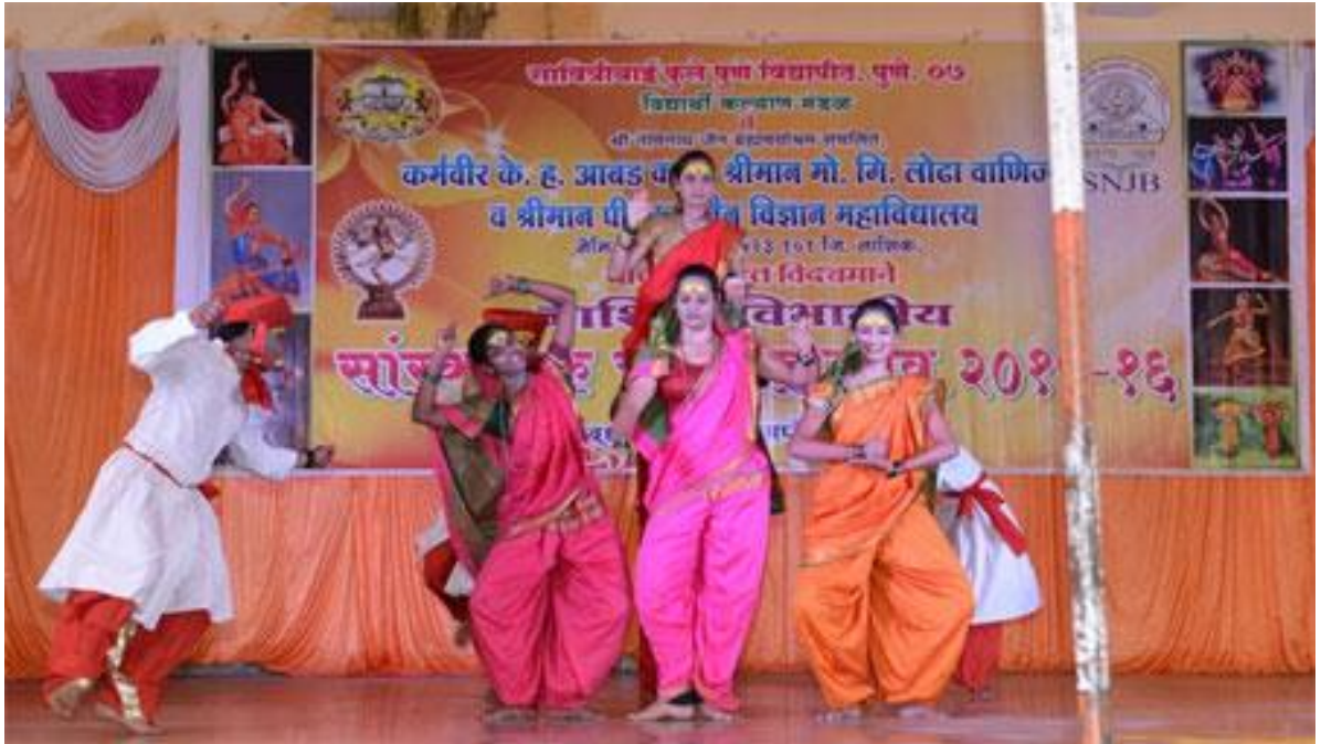
Youth Festival 2015-16