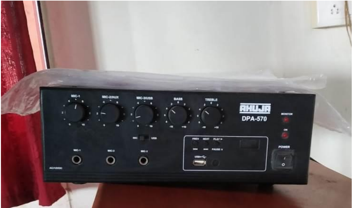
Amplifier, 50 Watts with Built-In Digital Player.