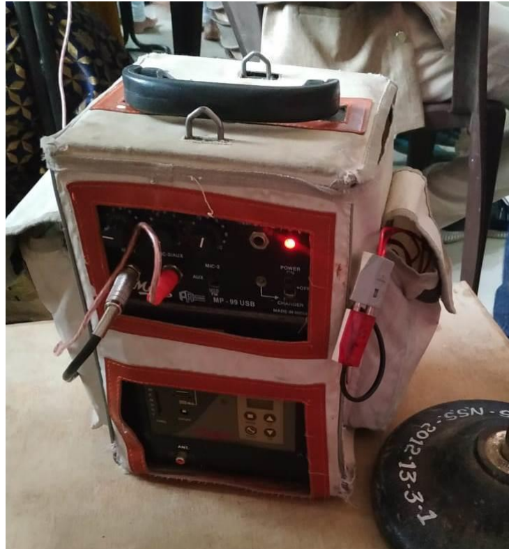
Amplifier with speaker (Battery backup & Charging)