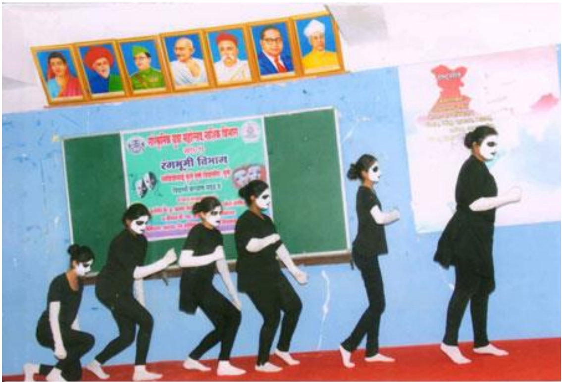
Mime Act by Students