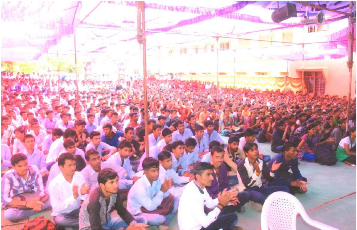
Students attending the cultural activities