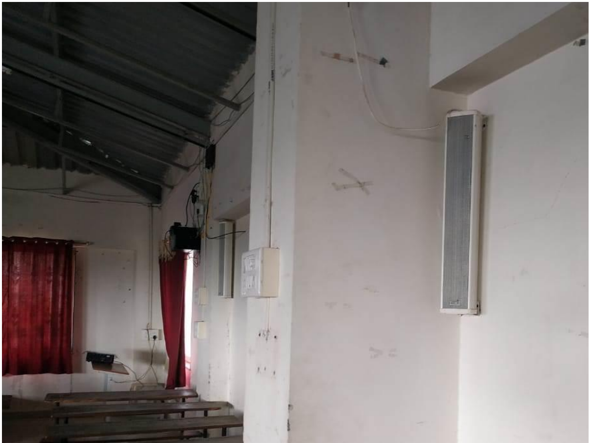
Pilar Speaker Unit