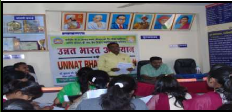
Caption: We organized Gramsabha at Rajdervadi With Sarpanch , Garmsevak , Student and Citizens