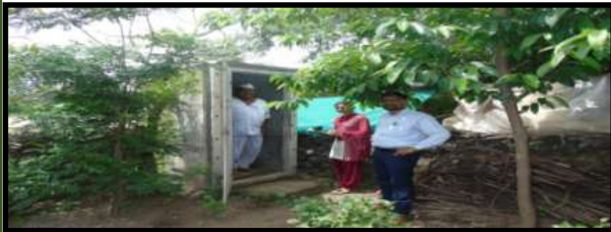
Caption: Creating awareness of Health and Hygiene