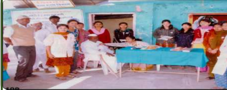
Caption: Health Checkup Camp