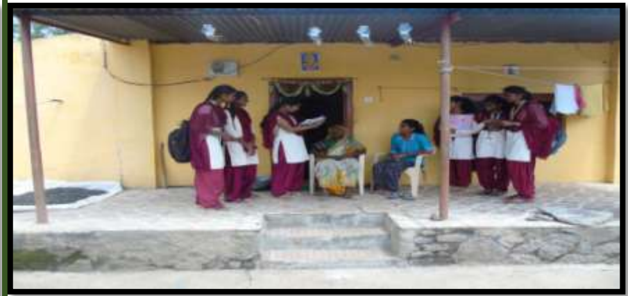
Caption: Village survey at Rajdervadi